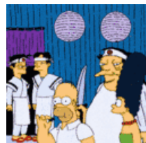
Fearless Fugu Finds Favor With A More