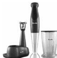
The Breville 9.6 Cordless Hand