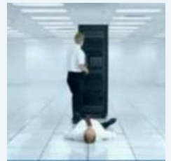
The Servers Are Too Hot!