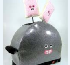
Plush Toaster Traumatizes Pop-Tarts