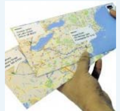
Google Maps Envelopes

Filed under: Entertainment Fun Halloween