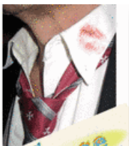
My(Separate)Space.com 7 Italian Fixtures - Social Network For Sure To Make A