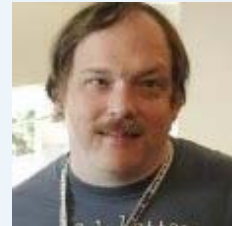
10 Sexiest Programmers