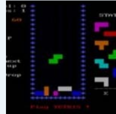
History of the Nerd #1: The Tetris Effect