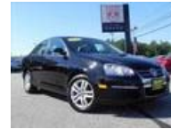
$13,980 2007 Volkswagen Jetta Tri City Dodge Subaru

Click here to view Foster's prints for sale