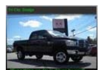
$27,980 2009 Dodge Ram 2500 Tri City Dodge Subaru